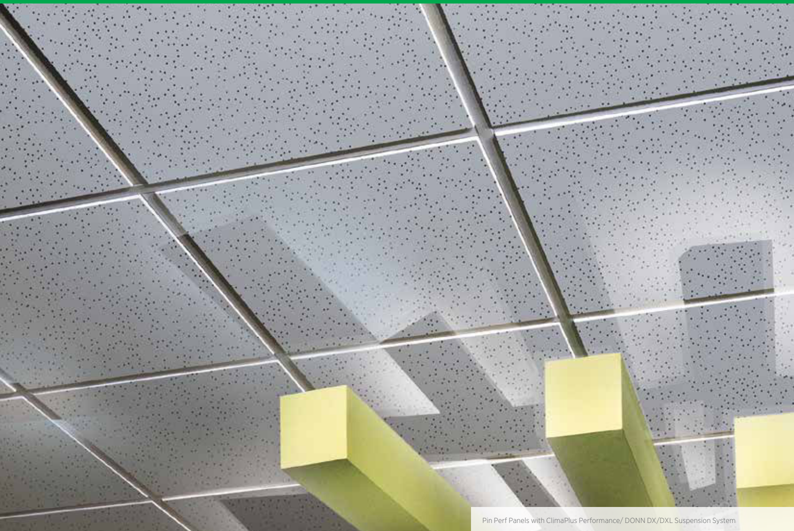
Pin Perf Panels with ClimaPlus Performance/ DONN DX/DXL Suspension System